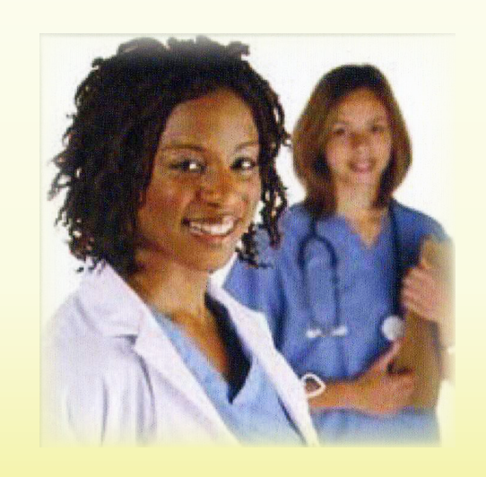
A REGISTERED NURSE IS AVAILABLE 24 HOURS A DAY