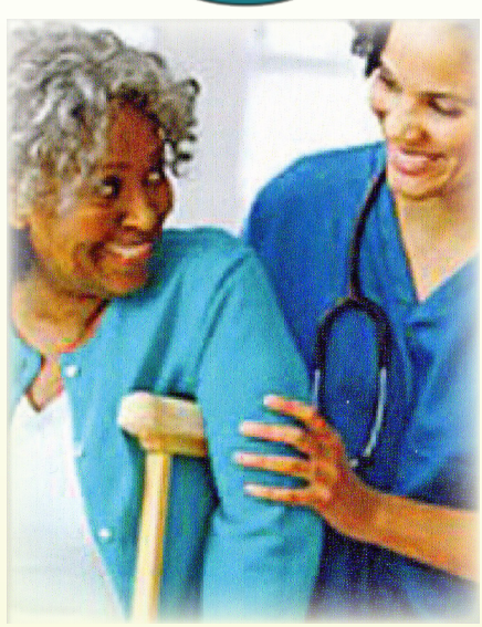
Compassionate Care Beyond Expectation

2041 Springfield Avenue Vauxhall, NJ 07088